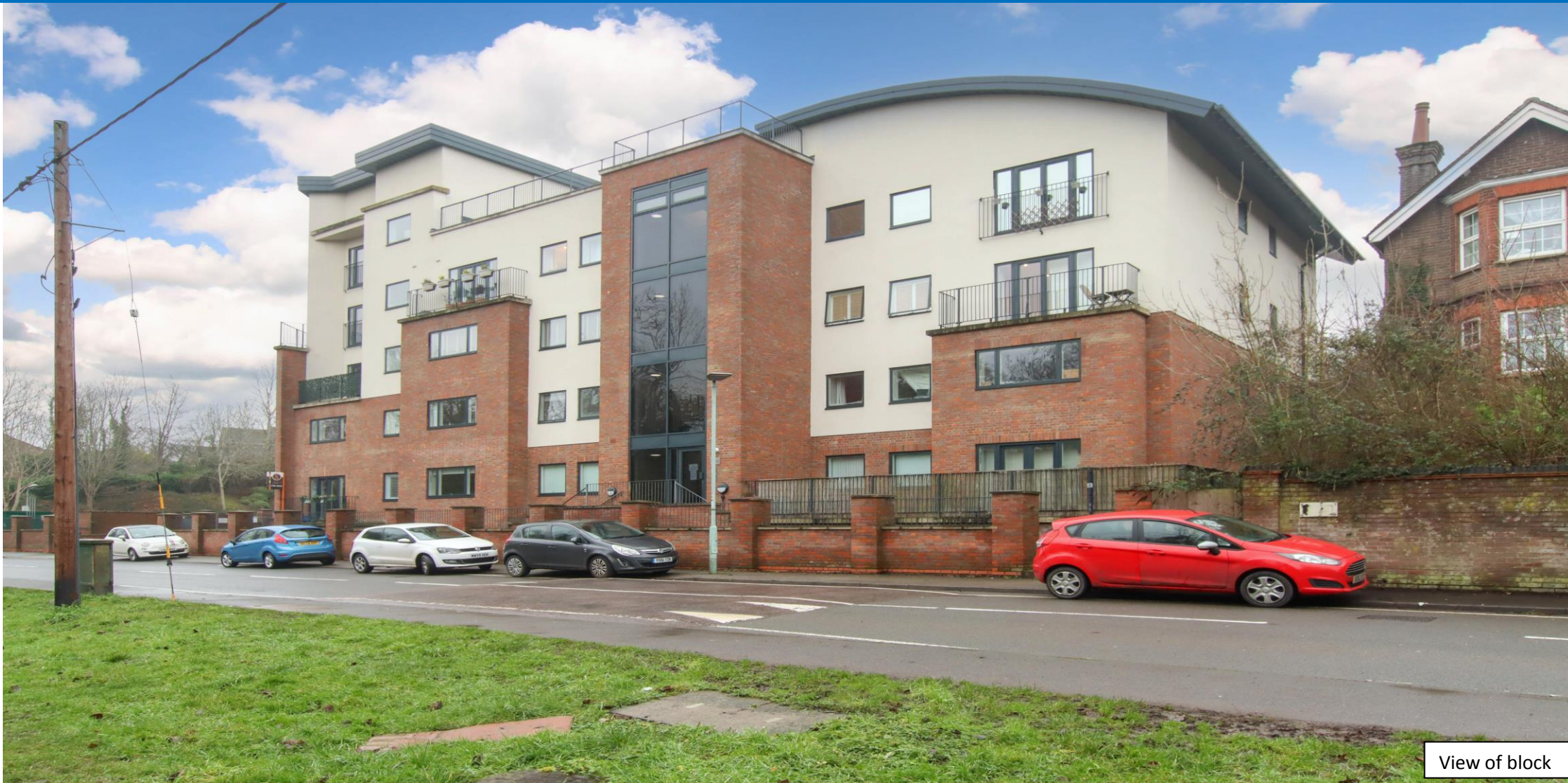
View of block